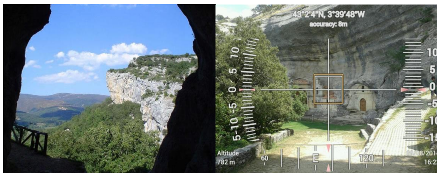
Photo: Ojo Guareña. Entrance

Ojo Guareña is categorised as a Natural Monument and is located in the north of the province of Burgos on the south slope of the Cantabrian Range. It forms a complex of caves internationally significant.